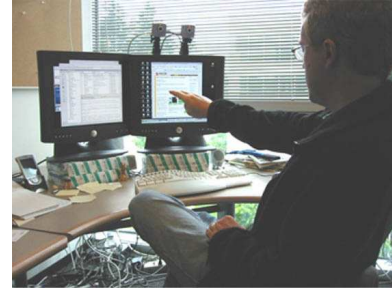
Fig. 1. Perceptual interfaces enable “casual” and “10 foot” interfaces in scenarios where mice and keyboards are not appropriate or available.

Unfortunately most examples of perceptual user interfaces are still quite fragile; these systems often are based on unique environmental circumstances (e.g. color models that highly depend on the lighting conditions), rely on the use of multiple CPUs or specialized hardware, are usually installed and