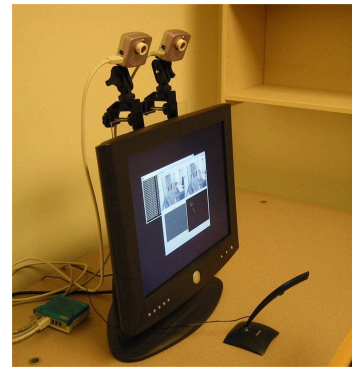
Fig. 4. Experimental Setup. Study participants were seated in front of a GWINDOWS-enabled display and an open microphone for speech recognition.

We performed a preliminary, qualitative user study to determine how everyday users of GUIs find using GWINDOWS. In this study, we confirm Kjeldsen’s observations on a related system in which he found users become adept at selecting and moving items on the display very quickly, while new users tend to tire easily holding up their hand [6]. Unlike Kjeldsen’s